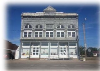
The opera house in Grainfield

I got to visit Grainfield on Wednesday June 17. I was taken on a tour of the projects that Grainfield PRIDE has been involved in, including park upkeep, planters on Main Street, and a volleyball court and park! I recommend that if you are ever in the area, you definitely should eat at the Dug Out!