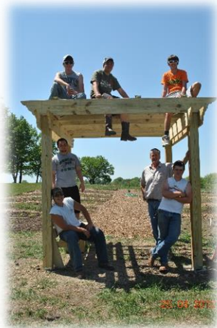
Past Partners in PRIDE grant winners posing with their pergola, built by community youth.